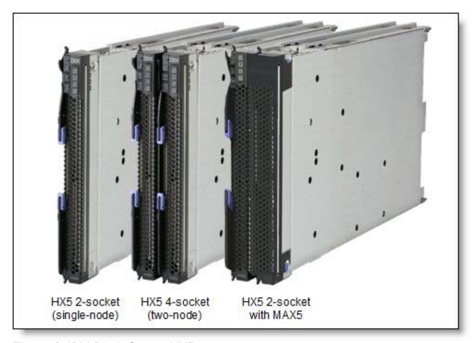
Figure 1. IBM BladeCenter HX5